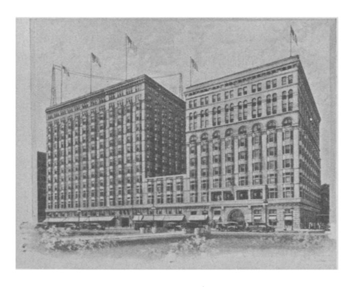
Hotel Congress, Chicago.

The complete utilization of cherry pits at an important cherry-producing center for the production of cherry kernel oil and other products has been described. As a new domestic oil of high quality, perhaps equally as useful as oils now imported for the purposes mentioned, cherry kernel oil should receive the consideration of the consuming industries.